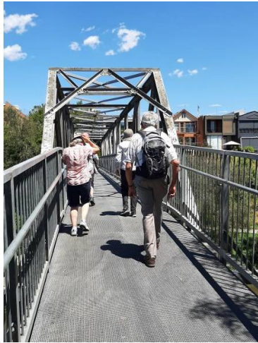
Crossing the river