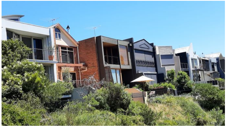
Hotch-potch of town houses