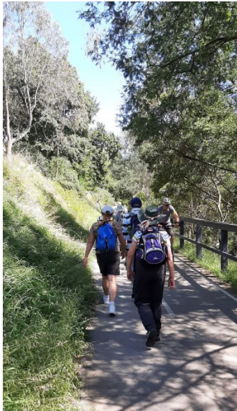
Setting off on Yarra trail