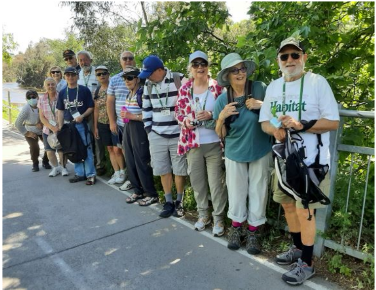
Walkers line up