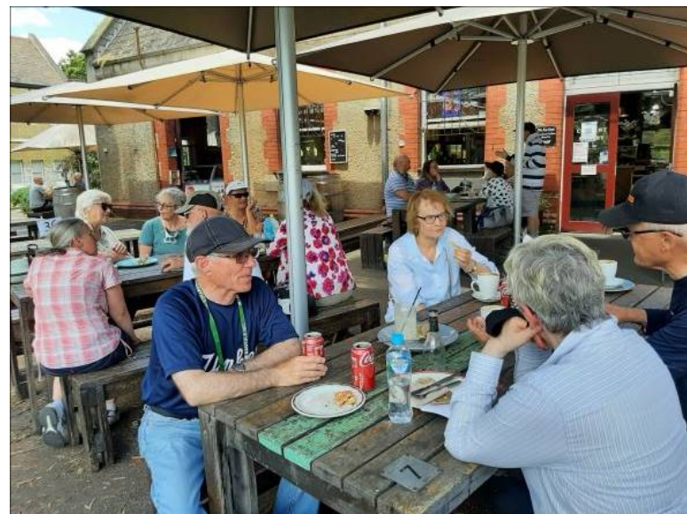
Lunch at the Abbotsford Convent