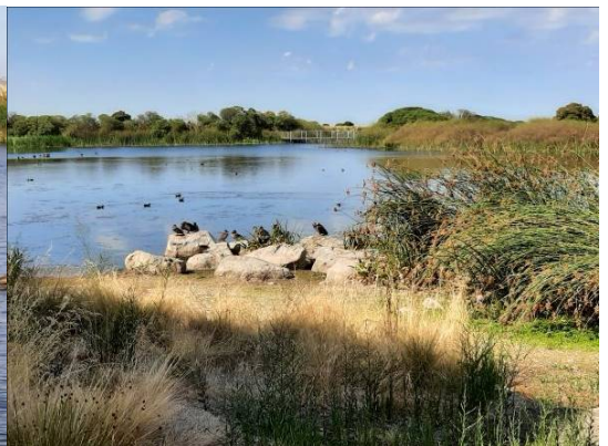
More water birds on the extensive lakes