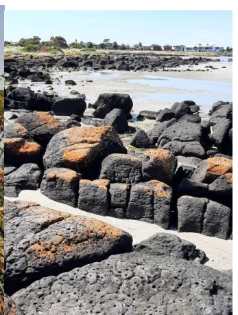
The beach black basalt rocks