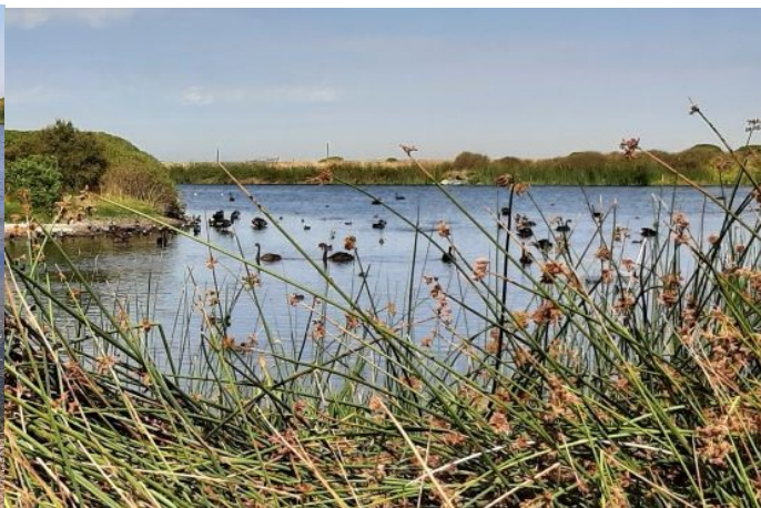
bird life on the lakes