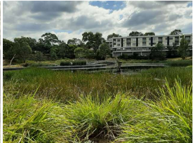
Wetlands created as part of the development