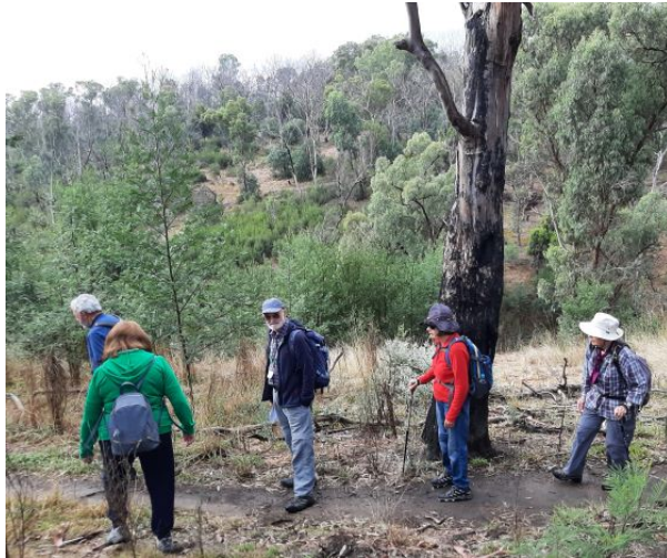
Intrepid U3A explorers