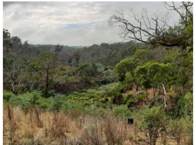
Plenty Valley landscape