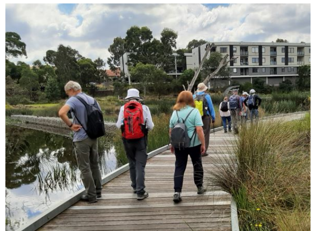
Exploring the wetlands