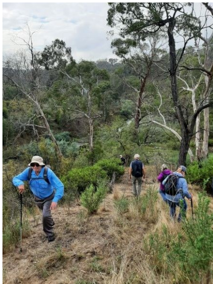
Further intrepid exploration