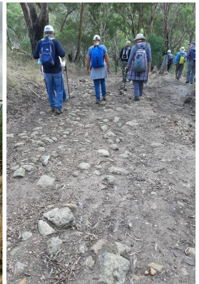
Cobb & Co trail