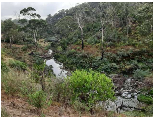
Plenty river tributary now called University Hill creek!