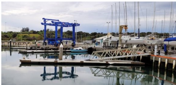
Multi-million dollar lifter / crane