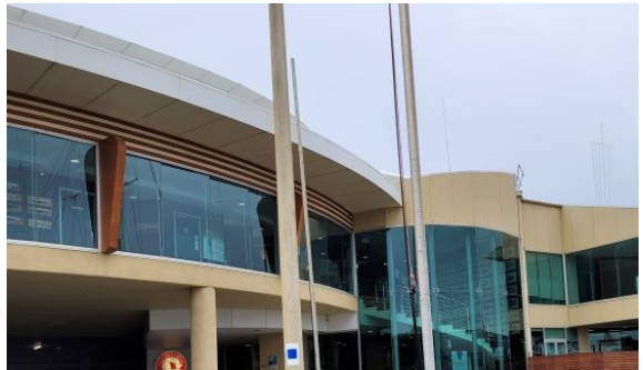
Sandringham Yacht Club