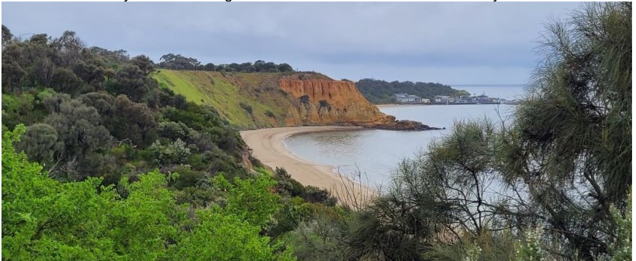
Half Moon Bay