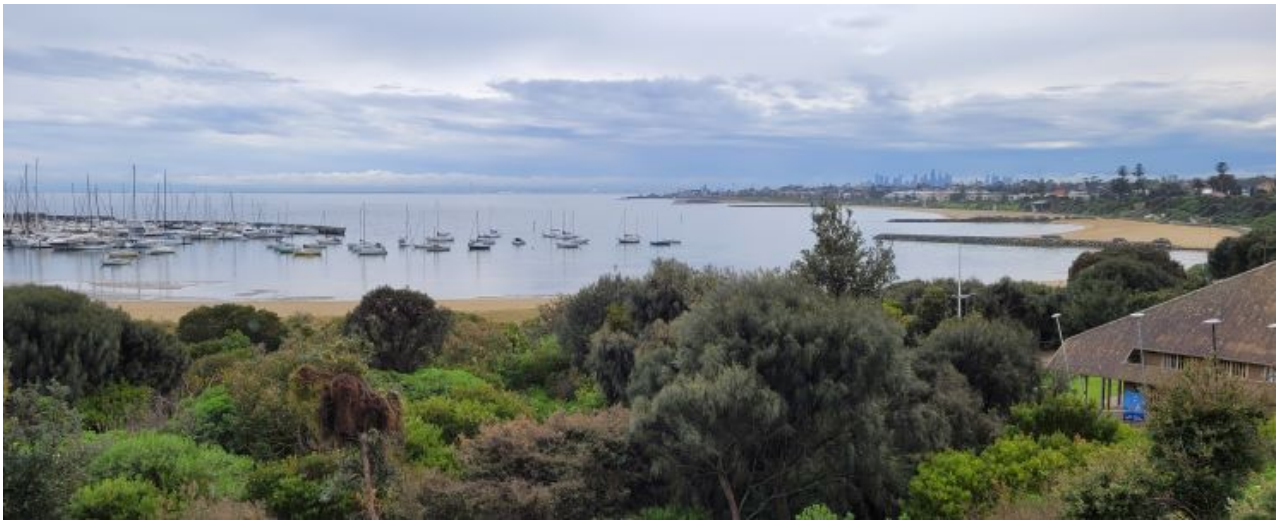
View from Bay trail – Sandringham marina to the left and Melbourne city on the horizon

A rainy start to the Ramblers 8km walk along the Bay trail – the weather improved in time.